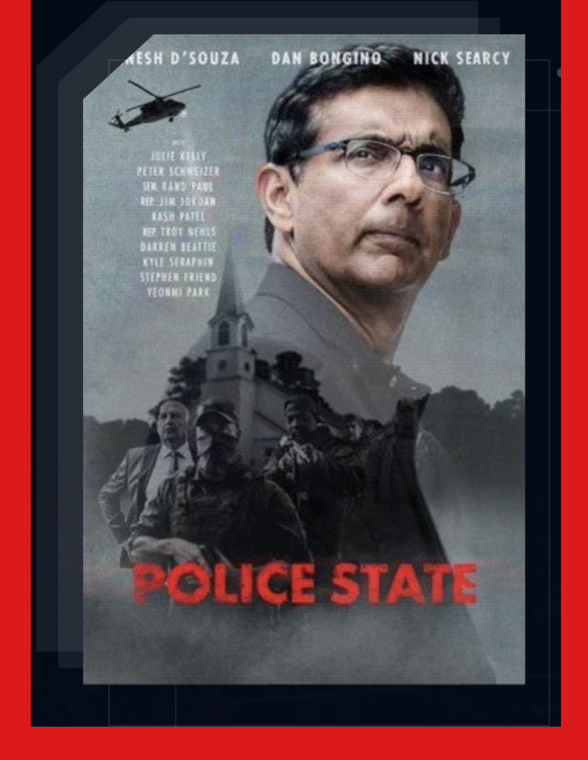
See POLICE STATE Trailer <u>HERE</u>